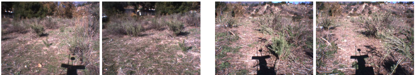
Fig. 3. Two sets of failed frames from from LAGR Arroyo data set. Note the large image motions (left pair) and obscuring vegetation (right pair).