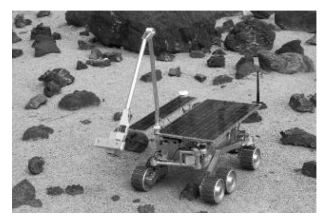
Figure 2: Rocky 7 rover.