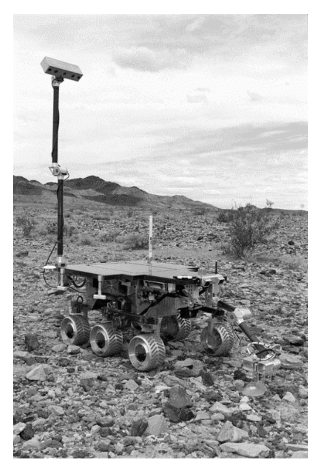
Figure 1: FIDO rover

The FIDO Mobility Sub-System consists of a 6-wheel rocker-bogie chassis. Each wheel is independently driven and steered with a 35 N-m torque/wheel at stall. Its flight-related actuator design provides a speed of < 9 cm/sec with 20 cm diameter wheels. Its ground clearance is 23 cm. The vehicle carries a 4 degrees-of-freedom mast with integral science instrumentation, and an instrumented science arm with four degrees of freedom and an actuated gripper/scoop.