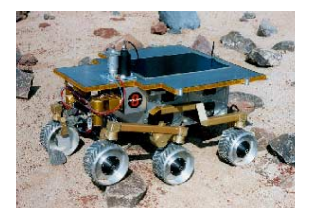
Figure 3: Rocky 7 and Rocky 8 Rovers